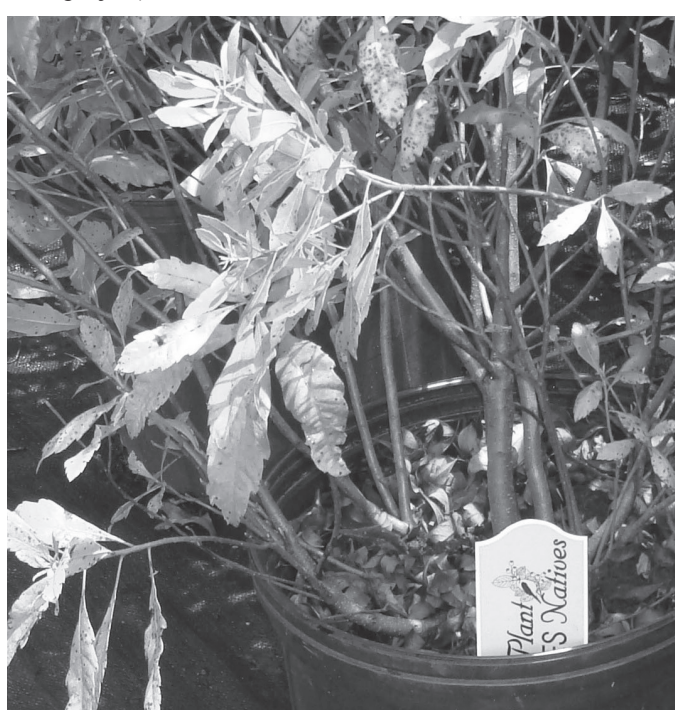
Local garden centers stocked natives for the 2010 spring and fall planting seasons.

The Flora of Virginia Project - http://dcr.virginia.gov/ natural_heritage/vaflora.shtml (Information on development of project)